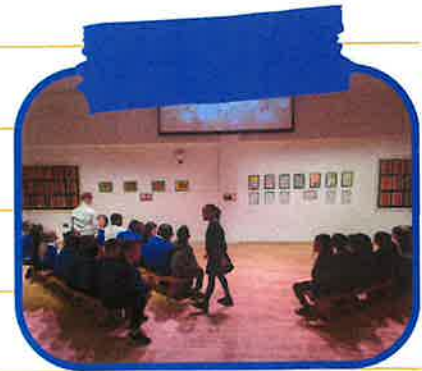
TAKE ONE PICTURE EXHIBITION