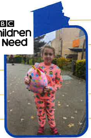
CHILDREN IN NEED