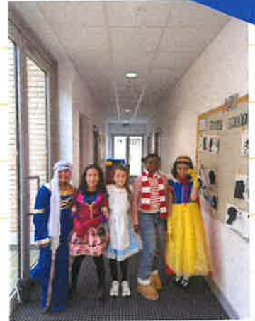
WORLD BOOK DAY FUN