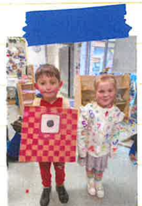
FAB NUMBER DAY COSTUMES

Therefore we work hard to give children the chance to find out about the world of work and to explore different jobs and places of work. Also to nurture their interests and talents that they hopefully will continue to develop and may even be what they choose to study or have a job linked to later on.