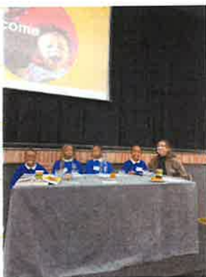
PANEL DISCUSSION AT THE LITERACY TRUST