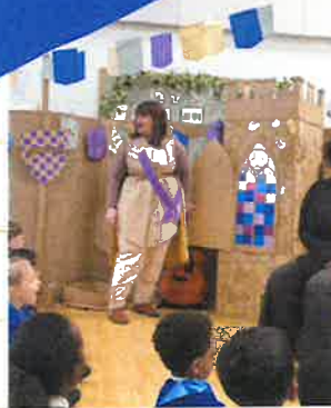
Y2 VISITING THE CARDBOARD CASTLE