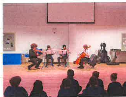
CENTRAL FOUNDATION STRING QUARTET ASSEMBLY