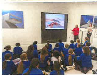
VISIT TO ZAHA HADID ARCHITECTS