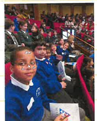
INSIDE MATHS EVENT