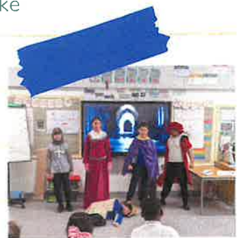
Y5 MACBETH DRAMA LESSON

In this newsletter I would like to share some of the work around one of our important values at Moreland - Aspiration .