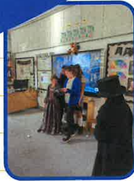
YEAR 6 GETTING IN CHARACTER IN THEIR ENGLISH LESSON