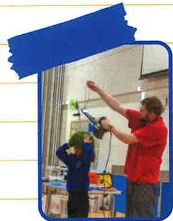
AMAZING SCIENCE SHOW