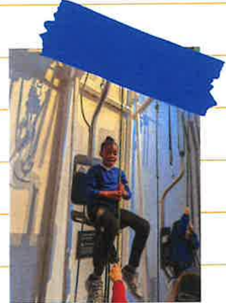
YEAR 4 SCIENCE MUSEUM TRIP