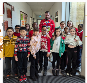
SHOWING OFF OUR CHRISTMAS JUMPERS