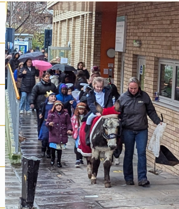
THE AMAZING PEDRO THE DONKEY.

Thank you also to our governors and community partners who support our school with such commitment and make so many things possible for our children.