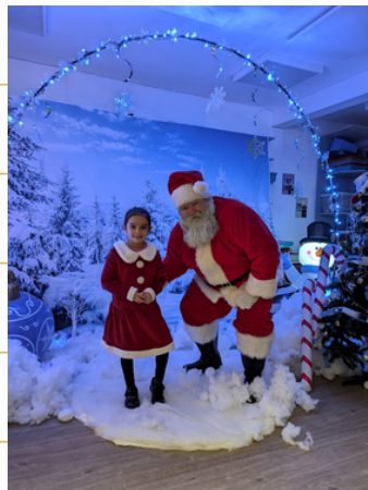
MEETING SANTA AT THE CHRISTMAS FAIR.