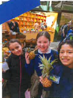
ECO TEAM AT BOROUGH MARKET