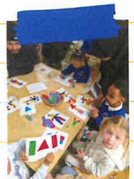
MATHS STAY AND PLAY MORNING IN THE EYFS

Children also benefit from regular opportunities to experience live music, both through in-school workshops with professional musicians and by attending and participating in concerts. This term alone, pupils have attended Singlinton, enjoyed concerts with the London Symphony Orchestra, experienced a piano recital at St Mary's Church, and taken part in an engaging wind quintet workshop here at school.