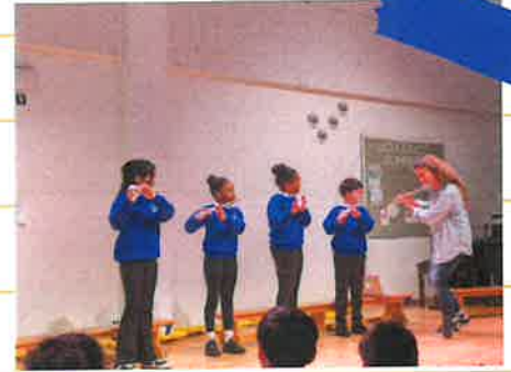
OUR FLUTE PLAYERS PERFORMING AT THE SPRING CONCERT