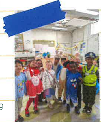
WORLD BOOK DAY FUN